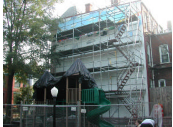
Mural in progress

Lynn Johnson reported that the mural was close to completion. Once the mural is completed, two coats of sealer will be applied. The wall tile art will be inserted after the mural is completed. The tile insertion should take two days and will be done in August. [ Postscript – As most of you are aware, the mural is now completed and the scaffolding has been removed. ]